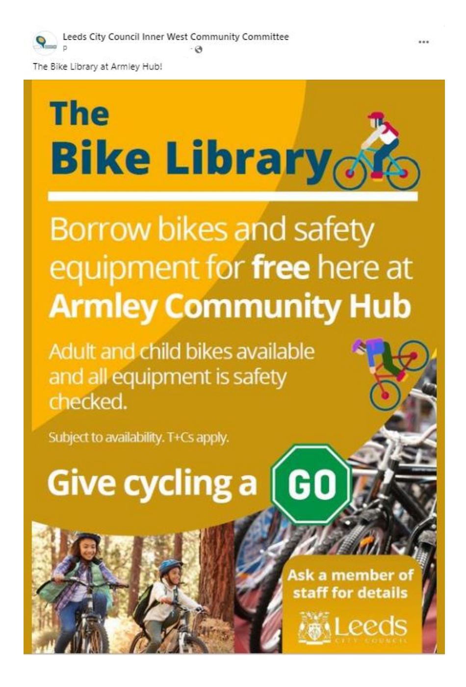
2<sup>nd</sup> Place – Armley Forum Post

Bike Library at Armley Hub Post: 3,783 people had this post delivered to them and it had 0 post clicks, with 69 likes, comments and shares.